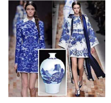
Fig.4 Blue and white pattern fabricl