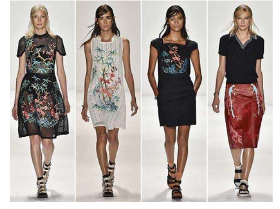
Fig.1 Positioning pattern application

The positioning pattern in the garment is designed according to the specific size of the specific part of the garment. It is designed for different parts, collars, sleeves, front plackets, hem, back, shoulders, waist, buttocks, legs, etc. Form is the most widely used in traditional clothing. The traditional traditional folk costumes used in the men's design work have precisely applied positioning patterns. On the sleeves, use the form of painting to make reasonable typesetting according to the size of the area. At the front hem, use flowers and plants to draw flowers and plants according to the size of the area.